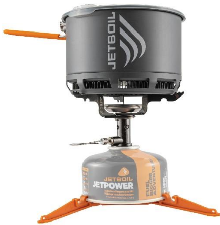
JetBoil Cooker x2 (£372)

A cooker crucial for heating water to cook food.