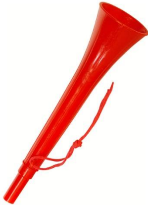
Fog Horn (£7.20)

Alerting other vessels of your presence in foggy conditions.