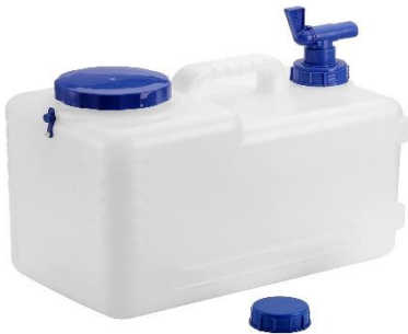
15 L Water Container (£24)

One container for emergency if water makers breakdown. Also, have one always filled with water for drinking and eating.