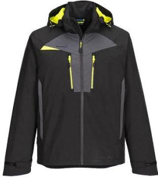
Foul Weather Jacket (£168)

Foul weather kit that has 20000mm rainfall waterproofing and is breathable.