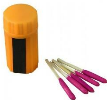
Resistant Matches (£13.20)

Waterproof and wind resistance army matches to light jet boil.