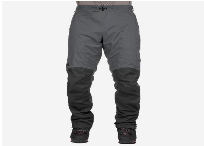
Foul Weather Bottoms (£64.80)

Foul Weather kit that has 15000mm rainfall waterproofing and is breathable.