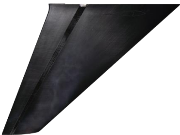
Spare Rudder (£1440)

A spare rudder in case the main breaks. Required for steering and for staying on course with the autohelm.