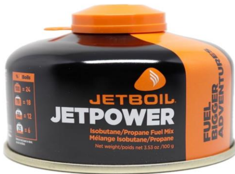
Jet Boil Fuel (£16.80)

A cooker crucial for heating water to cook food.